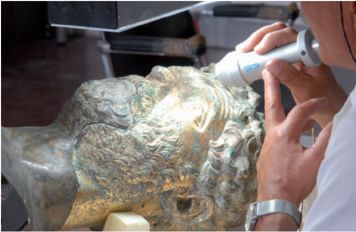
Parma, National Archeological Museum, Head of Antoninus Pius, gilded bronze

The Eos 1000 LQS adopts the particular Long Q-switch pulse length (100ns), specially designed and tested for the cleaning of the gilded bronze frieze of the Gates of Paradise, by Lorenzo Ghiberti, from the Baptistry in Florence. Since its initial application on this masterpiece its use spread to a wide range of applications that make the EOS 1000 LQS an extremely versatile system for the restorers thanks, in part, to its small size and light weight. The EOS 1000 LQS is suitable for highly accurate cleaning of metal and gilded surfaces, frescoes and painted surfaces, wood, valuable stone artifacts . The laser beam is delivered through a 3 m (optional 10 m) optical fiber and a handpiece with variable focus.