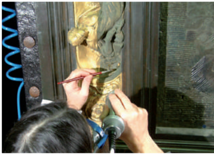
Florence, Baptistry, Gates of Paradise, gilded bronze