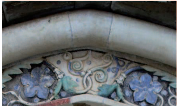
Amatrice (RI), Church of Saint Francis stone gate