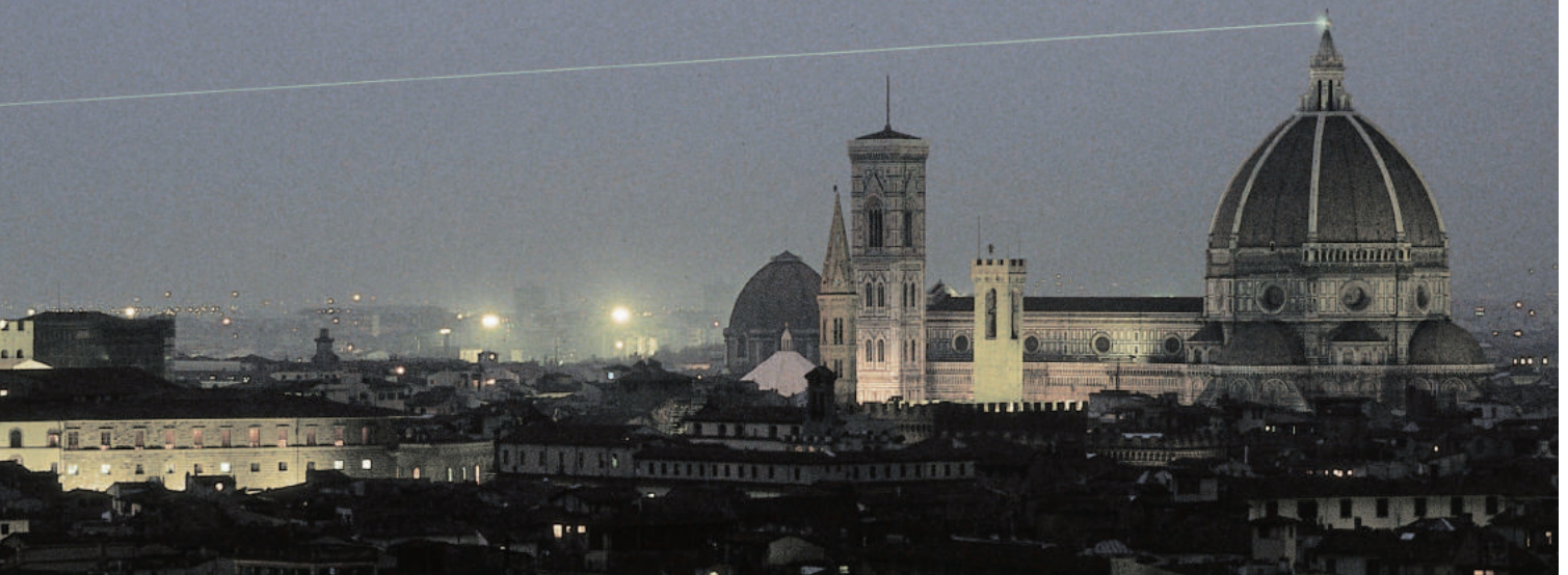
El.En. Laser over Florence (homage to Arnolfo di Cambio, Dani Karavan, June 1999)