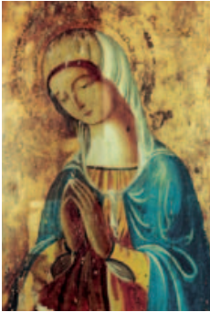
Removal of old varnish from a painting

Light Brush 2 is an Er:YAG laser system optimised for the cleaning of artworks. Er:YAG laser cleaning is based on the strong absorption of the 2940 nm wavelength from superficial layers containing OH bonds. Studies shown indeed that Er:YAG laser exposure on a surface dampened with a liquid containing – OH groups effectively removes old varnish and other encrustations without inducing unwanted chemical or physical changes on the original surface. For this reason, Light Brush 2 is particularly suitable for the removal of overpaintings and varnishes from wall and easel paintings. Light Brush 2 is an innovative tool for restorers thanks to variable energy emission from 50 mJ to 500 mJ and to the pulse duration optimised for the cleaning of Cultural Heritage.