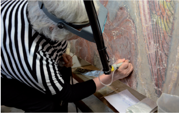
Pisa, Monumental Cemetery, Wall paintings