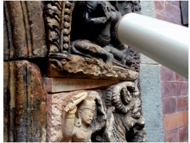
Patan (Nepal), Royal Palace, stone gate