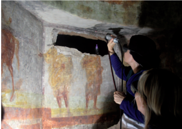
Rome, Catacombs of Saint Domitilla, wall paintings