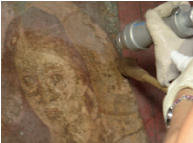
Pompei (NA), Villa of the Mysteries, wall paintings

The Eos Combo , the result of a collaboration between El.En. and the Consiglio Nazionale delle Ricerche (CNR), combines two temporal regimes in one system. By pressing a key you can move from the Short Free Running (SFR) mode, with a pulse duration ranging from 30 to 110 microseconds, to the Long Q-switch (LQS) regime with 100ns pulses. This versatility allows the treatment of a wide variety of materials, such as stones, metals, wall paintings, wood, ceramics. The system was tested under the most difficult field conditions and, thanks to its sealed laser head, demonstrates high reliability. The Eos Combo , employing new optical fibers, combines manageability and performance, guaranteeing the conservator the optimization of costs and results.